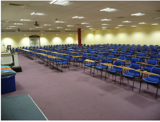
Conference Teas/Coffees and Exhibition Space