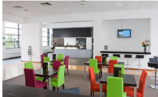
Lunches/breakfasts in Aston Business School Restaurant Ad hoc meeting space (it's actually a lot larger than this picture suggests)