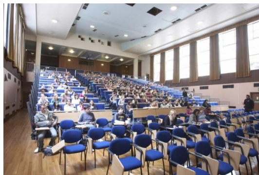
Main Conference Sessions and Breakout Stream 1 – capacity 600

Lowered kerbs, lifts and adapted facilities, along with the compact and flat nature of the 40 acre campus, all help facilitate the mobility and general well-being of those with disabilities. Disabled car parking is available but spaces will need to be booked in advance.