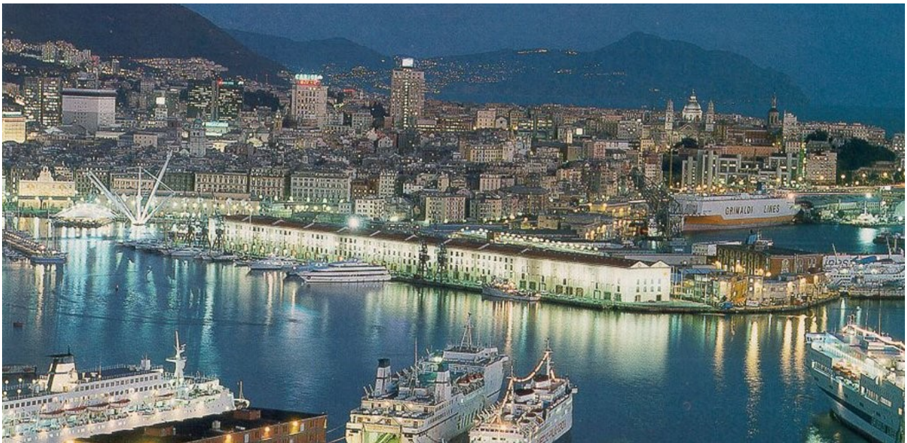
The city seen from the harbour

In this city, languages and cultures have always mixed in the centuries, since the time of the Crusades, making it a melting pot "ante litteram". The influences, that range from Portuguese and Spanish into Turkish and Arabic, are recognizable in the spoken dialect. Just walking under the arcades of Sottoripa you can find some of the old smells from the shops that churn out "farinate" and fried fish served in paper, just as two centuries ago. With a few steps the visitor passes through historic places restored and arrives to modernity with major urban renewal made in the last decade: on one side Via San Lorenzo, Palazzo Ducale and the splendid Via Garibaldi, rich in museums, on the other one the Porto Antico with the Acquario (the largest exhibition of biodiversity in a European aquarium) and the many linked attractions.